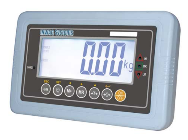
Figure 3 California indicator.