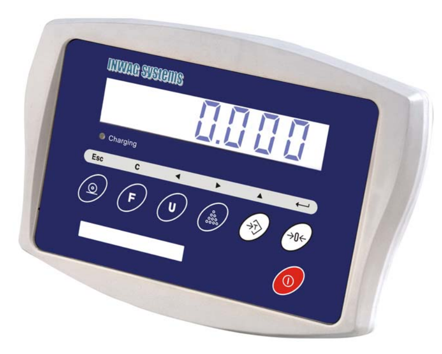
Figure 4 Kansas indicator.