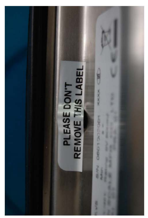
Figure 5 Sealing of Boston