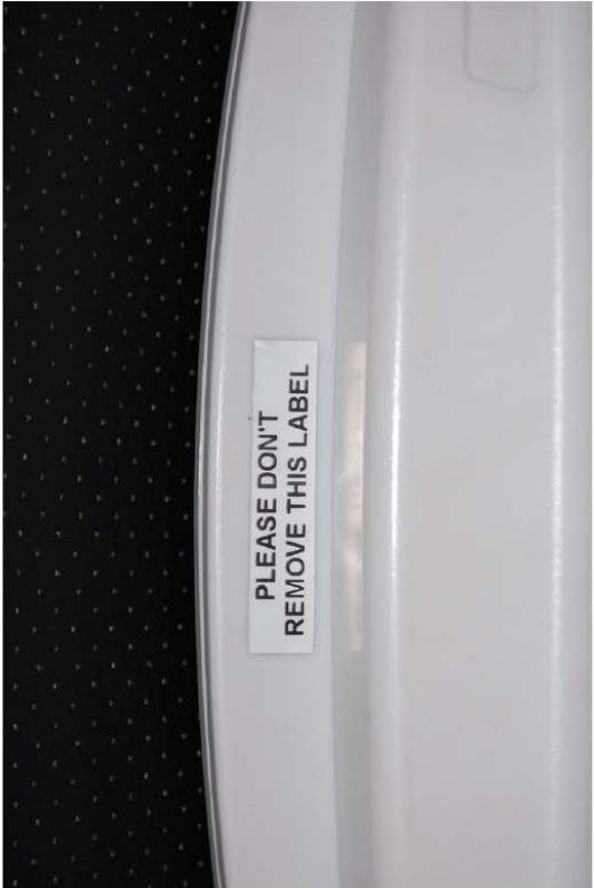
Figure 8 Sealing of Kansas