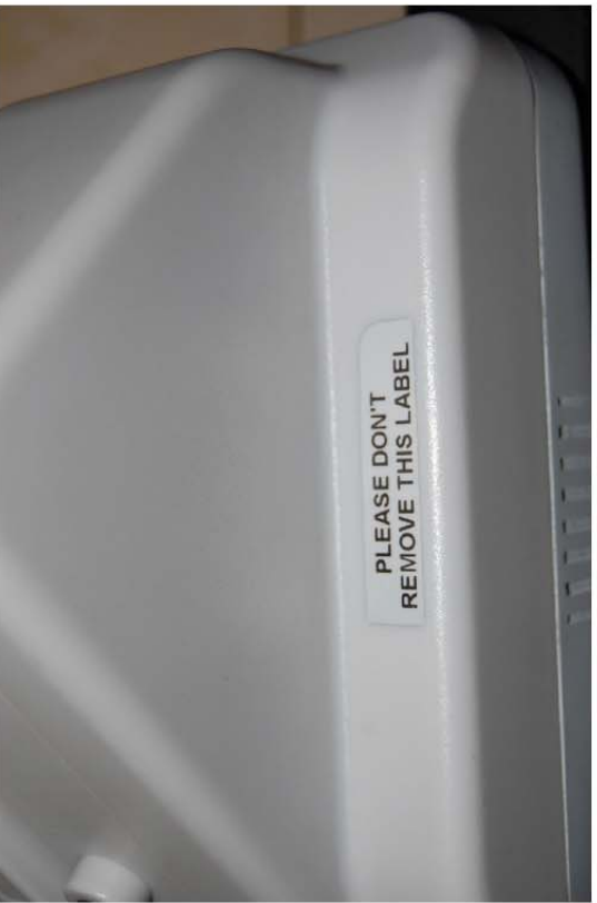
Figure 7 Sealing of California