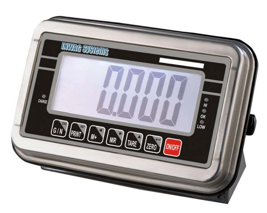
Figure 1 Boston indicator.