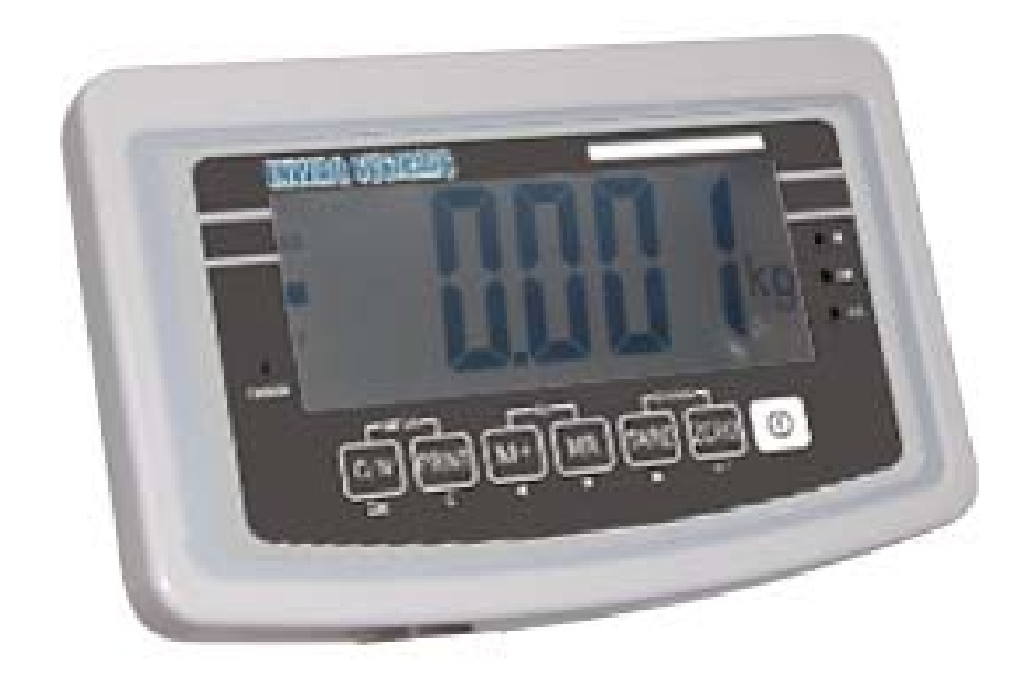
Figure 2 Vegas indicator.